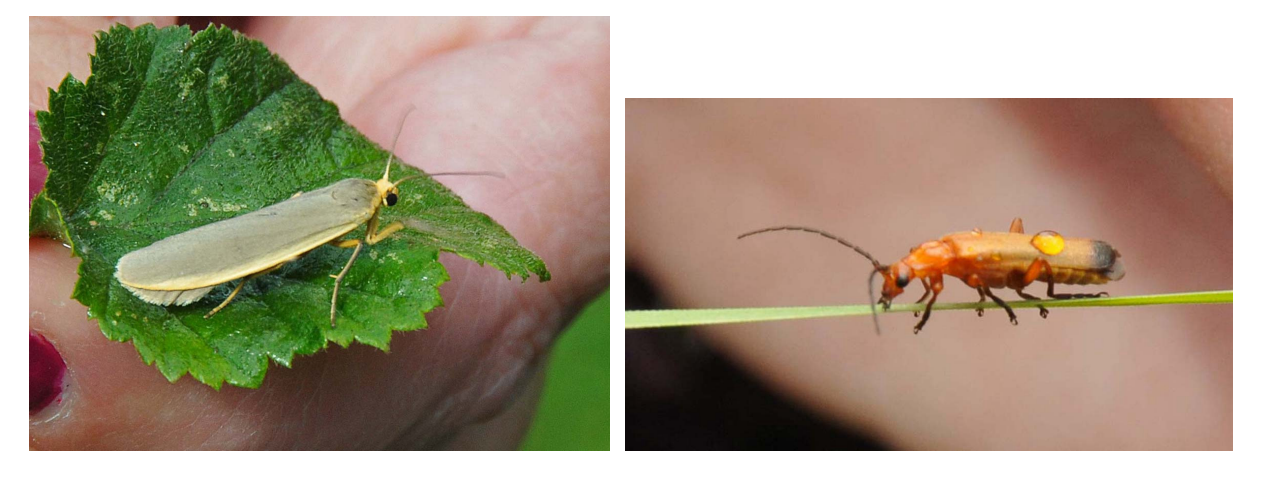
Common Footman Moth